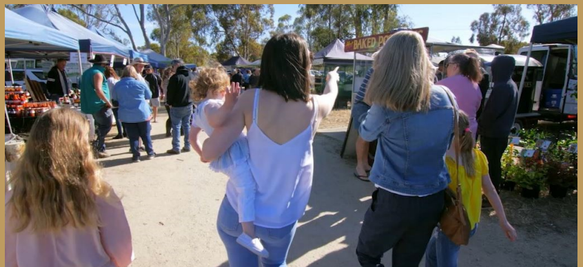
ABOVE: The Murrabit Country Market benefitted from support from the Gannawarra Community Resilience Grants program.

The grants will support community-led activities that align with the following priorities from the Gannawarra COVID-19 Community Relief and Recovery Plan.