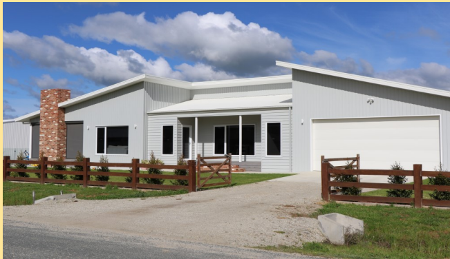
New residential home in Koondrook

With Melbourne experiencing difficulties, residential developers are now looking to regional Victoria where demand is strong.