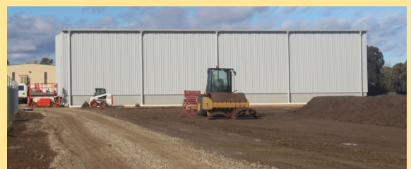
New Faucet Stroman shed in Tate Drive, Kerang

In Gannawarra the planning applications equated to $43.6m with Koondrook recording 18 applications for new dwellings.